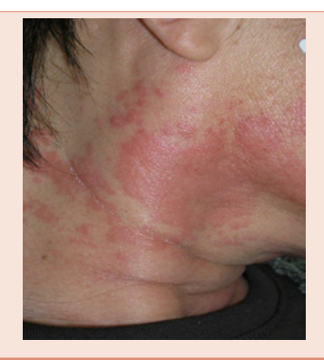
Figure 1a: Clinical findings of dermatitis on the face.

In Japan, many ginkgo trees grow along the street. Ginkgo trees are the world's oldest trees, and the leaves of ginkgo trees change color