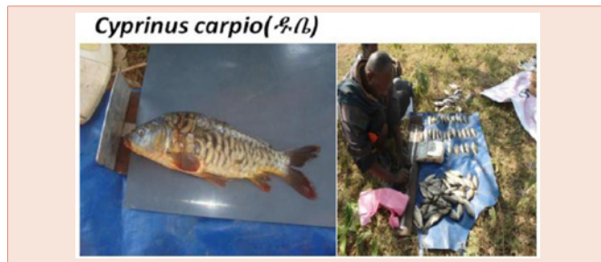
Figure 4: Cyprinus carpio found at Geray Reservoir.