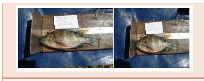
Figure 6: Tilapia randelli in Geray reservoir.

Based on the parameters investigated the only visible threat that might occur in this reservoir for the future to the water quality and fish production is cultural eutrophication which was more pronounced at the inlet site as a result of human activities on the site.