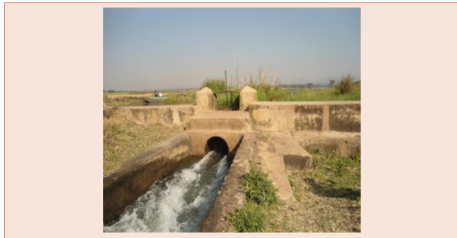
Figure 2: The Outlet site of the reservoir.