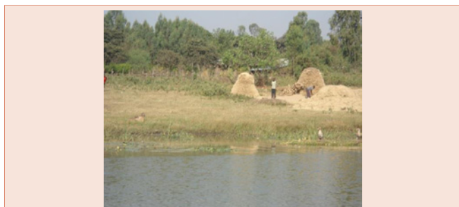
Figure 3: Inlet site of the reservoir.