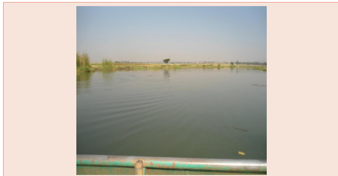
Figure 1: Open water site of Geray reservoir.

In Geray reservoir during this study period 51.3, 50, 47.3 mg/L was the recorded mean total hardness value in the open water, inlet and outlet side, respectively which shows the water is soft. Water is soft when the mean range of the total hardness fell within (32–60 mg/L) [7]. From this we can conclude that the reservoir's water can be said soft.