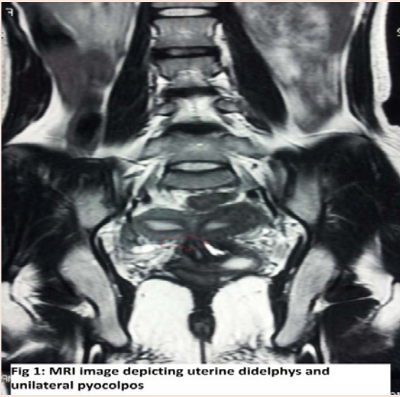
Fig 1: MRI image depicting uterine didelphys and unilateral pyocolpos