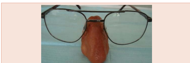
Figure 3: Nasal prosthesis with eye glasses.