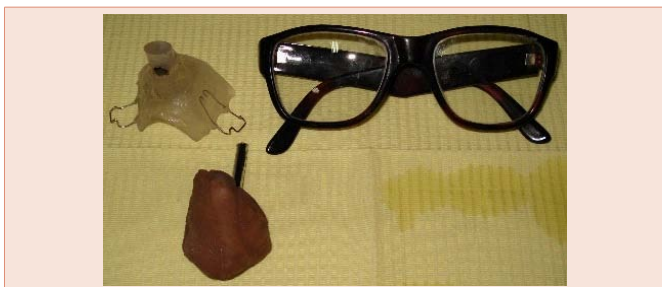
Figure 6: Nasal prosthesis, Palatal prosthesis and Glasses.

was fabricated and delivered to the patients within a week to achieve the objectives outlined.