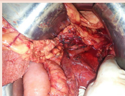
Figure 2: Intraoperative image, Complete section of the pancreas body.