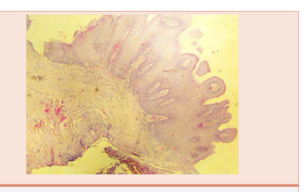
Figure 3: Hyperplasticstratified squamous epithelium with a fibrovascular