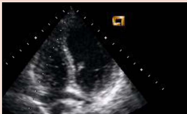
Figure 1: Transthoracic echocardiogram: Appearance of micro bubbles in the left atrium after 6 beats from opacification with shunt extra cardiac. Mention the title and explanation of figure.

POPH is defined as pulmonary hypertension associated with portal hypertension whether or not portal hypertension is secondary to hepatic disease. Diagnosis is based on the pressure obtained by a RHC with MPAP > 25mmHg, pulmonary arterial occlusion pressure