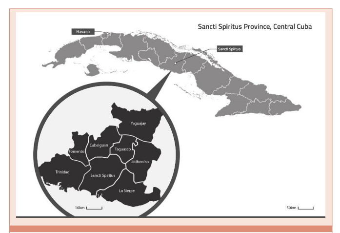
Figure 1: Map of Cuba showing the location of the Sancti Spiritus Province and its corresponding municipalities. (see attached).

Only patients with definitive clinical diagnoses were included in the study. Clinical diagnosis of acquired OT was defined by the presence of classic active focal retinochoroidal inflammation without associated retinochoroidal scars in either eye as well as a response to therapy as expected. Furthermore, these patients had no history of prior documented episodes or symptoms suggestive of prior episodes. A diagnosis of congenital OT was made based on multiple factors including: the presence of quiescent retinal toxoplasmic scars before the age of seven years, complications, and retinochoroidal lesions in the mother. Because of the presence of old scars in some patients, the exact time of onset of ocular disease who could not be determined and these patients were classified as undetermined.