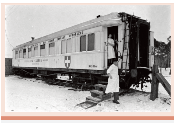
Figure 4: Dental Train [4].

The objectives of the International dental aid were the following: Care for Children