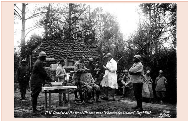
Figure 3: A dentist on the front near the « Chemin des Dames » - September 1917 [4].