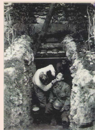
Figure 2: A dentist operates a man on the doorstep of the aid station [15].