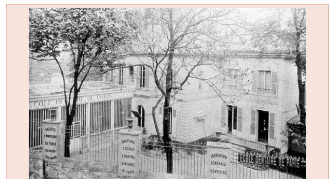
Figure 4: The Dental School of Paris in 1890 [5].

From 1917, dental schools organized bracing centres for ambulatory sick men in collaboration with military hospitals and stomatological centres. On March 10, Villain was inexhaustible and was always behind Godart's back who finally ordered to make dental braces free for the soldiers and non-commissioned officers. On April 7, the regimental dental officer was born. At the end of 1917, 50 army dental officers were counted. On July 3, a bill informed the dentists that they were to receive the required equipment they needed from