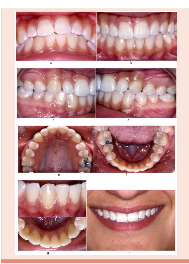
Figure 4: Transposition between the mandibular right lateral incisor and mandibular right canine, after the treatment.

0.51%) and shows the highest incidence of transposition with the first premolar [6]. Although less frequent, but canine transposition has also been documented with lateral incisor, central incisor and rarely with the second premolar or first molar [3,7,8].