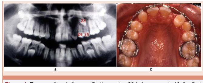
Figure 1: Transposition In the maxilla the canine-23-is transposed with the first premolar 24.

Unilateral tooth transpositions have been reported far more