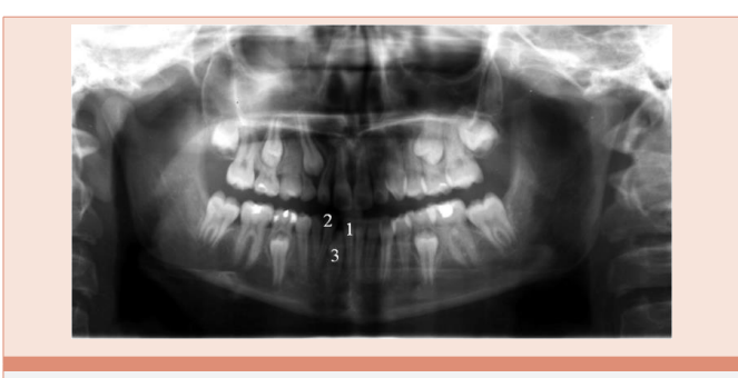
Figure 2: Transposition between the mandibular right lateral incisor and mandibular right canine, before the treatment.

The literature shows that any tooth can show transposition. It occasionally happens that a central incisor is situated between the lateral incisor and the canine of the same side, right central incisor may be situated in the place of the left and the left in the place of the right incisor. It might also be that a lateral incisor is situated between the canine and first premolar and sometimes canine erupts between the first and second premolar [4,5]. Statistically, the maxillary permanent canine is the most frequently involved tooth in transposition (0.135-