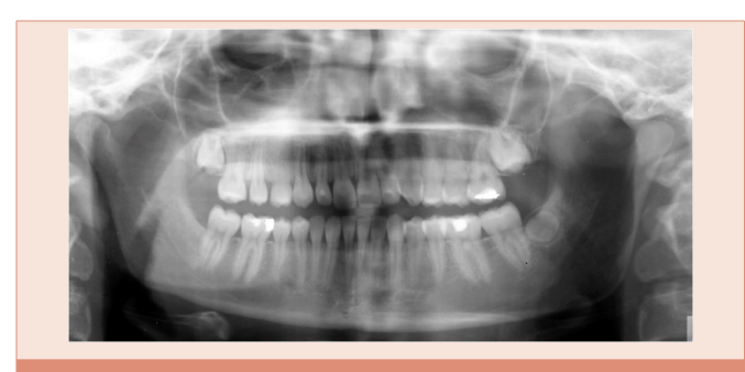
Figure 3: Transposition between the mandibular right lateral incisor and mandibular right canine, after the treatment.

Citation: Watted N, Abu-Hussein M (2016) Dental Transposition of Mandibular Canine and Lateral Incisor. J Dent Probl Solut 3(1): 045-049. DOI: 10.17352/2394-8418.000034