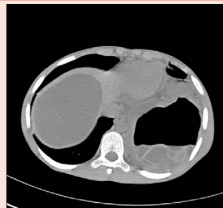
Figure 3: Intact on the right, perforated hydatid cyst on the left.

The complications in ruptured hydatid cysts are seen more frequently compared to intact cysts hydatidics [8]. Complications of a ruptured cyst can be ordered as: asphyxia (membrane and cyst fluid expectoration), hemoptysis, anaphylactic shock, respiratory failure, pneumonia, destroyed liver, bronchiectasis, pulmonary abscesses, empyema, pneumothorax, and aspergilloma in the cyst cavity (Figure 5). Additionally, a perforated hydatid cyst can cause extrapulmonary destruction in the sternum and ribs.