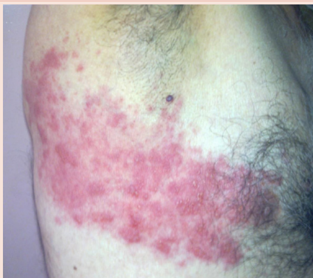
Figure 2a: Before treatment.