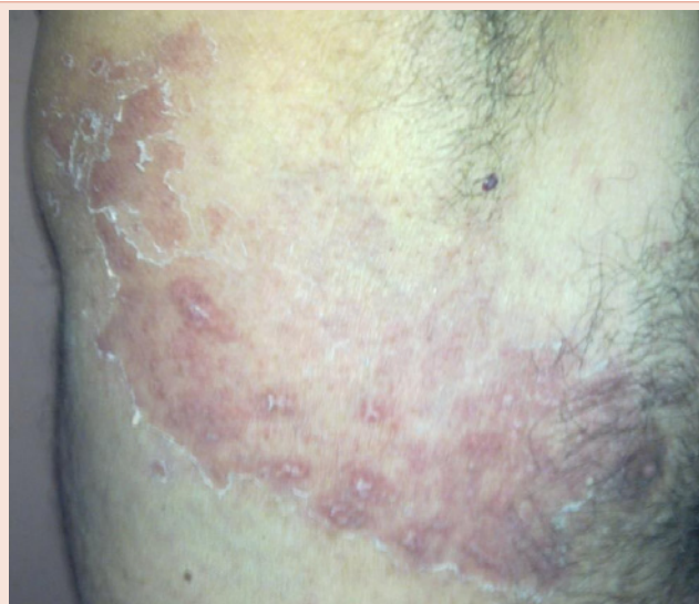
Figure 3: After treatment.