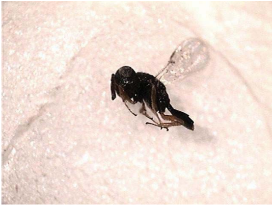
Figure 1: Pachycrepoideus vindemmiae (Rondani) (Hymenoptera: Pteromalidae).

Table 2 shows the biological characteristics of the parasitoids