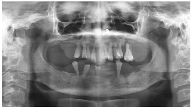
Figure 2: Orthopantomogram showing generalized severe alveolar bone loss.

Gingival fibromatosis is a rare, benign, non-haemorrhagic fibrous enlargement of gingival tissue. It was previously called elephantiasis gingivae, hereditary gingival hyperplasia and