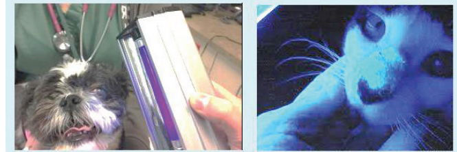
Figure 2: Wood's lamp for diagnosis of fungal disease in domestic animals.

The original glass filter material has been replaced by newer materials (e.g. barium-sodium-silicate glass incorporating 9% nickel oxide) that coat the inside of glass tubes. The Wood's lamp glass is deep violet blue and is opaque to all visible light rays except the longest red and shortest violet wavelengths. It is transparent in the violet/ultraviolet band between 320 and 400 nm with a peak at 365 nm and a broad range of infrared and the longest, least visible red wavelengths [14]. Fluorescence occurs when light of shorter wavelengths initially emitted by the lamp, is absorbed and radiation of longer wavelengths is emitted [14]. Thus, it excludes most of the burning and tanning shorter rays (<320 nm) and the visible rays longer than 400 nm). A Wood's lamp is often mistakenly referred to as a "black light" but these are distinctly different things [14].